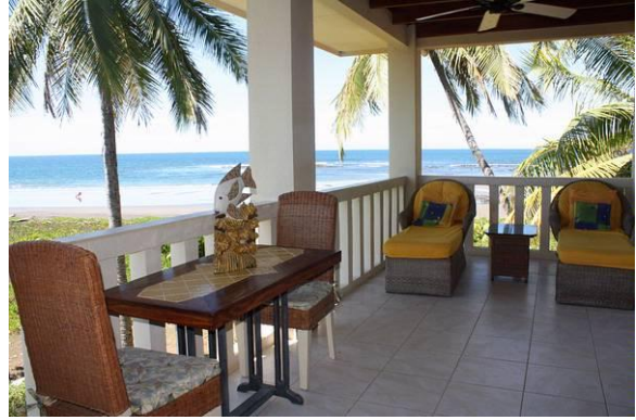
Lanai view of Playa Venado