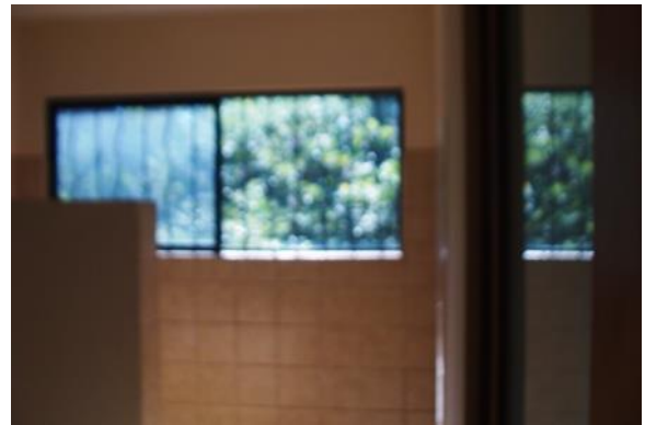
Large Walk-in Shower