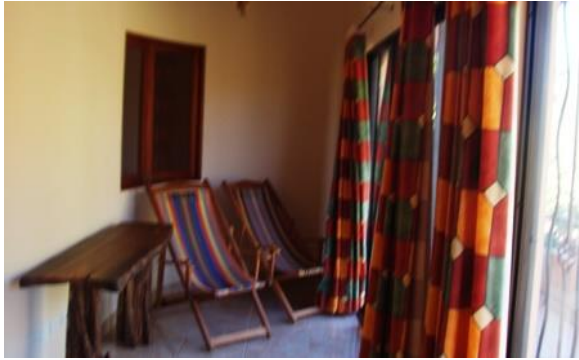
Sitting Area by Balcony