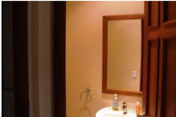
Jack and Jill Bathroom