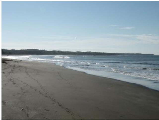
50 yards to this beach\ Map (Brisas del Mar is #18)