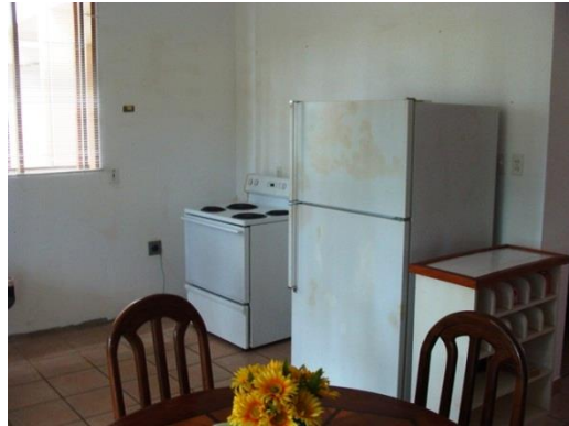
Kitchen to remodel