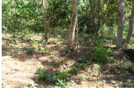
Lush Vegetation on both sides of the driveway