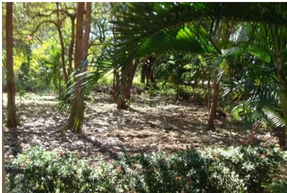
From Road to Top of Hill